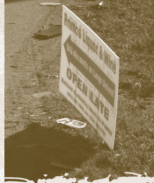
Snipe Sign Example

There is a difference between these types of signs and those that are found along roads such as real estate signs, or other signs which are properly permitted. You can always contact the Code Enforcement Department at (954) 434-0008 if you have any questions related to this new ordinance.