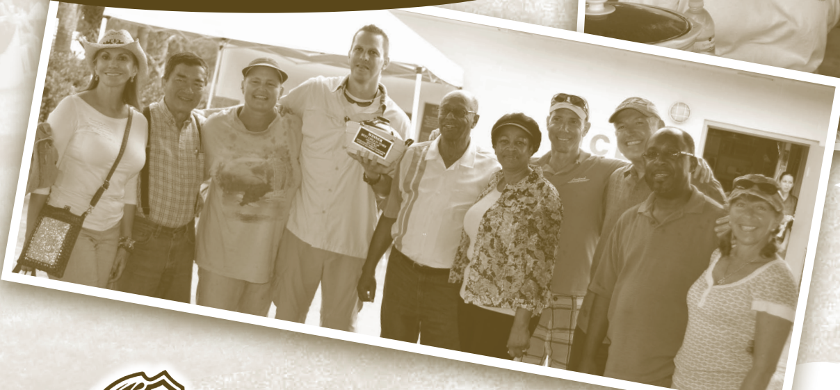
Aster Knight Parks Foundation Board Members & Chili Winner