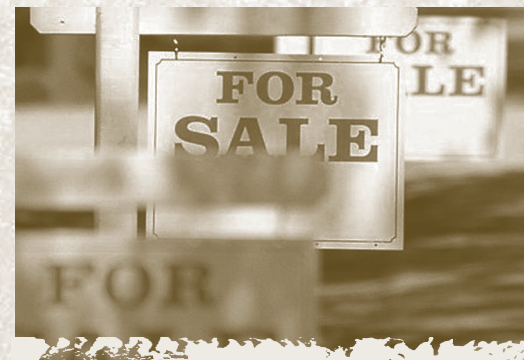
Real Estate Signs